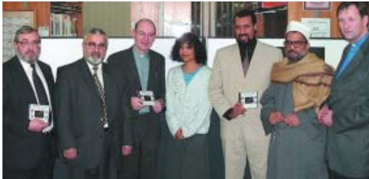
Interreligious Group at the launch of resources for the new Junior Certificate in Religious Education.

The Institute promotes a policy of equality and respect among all staff and students.